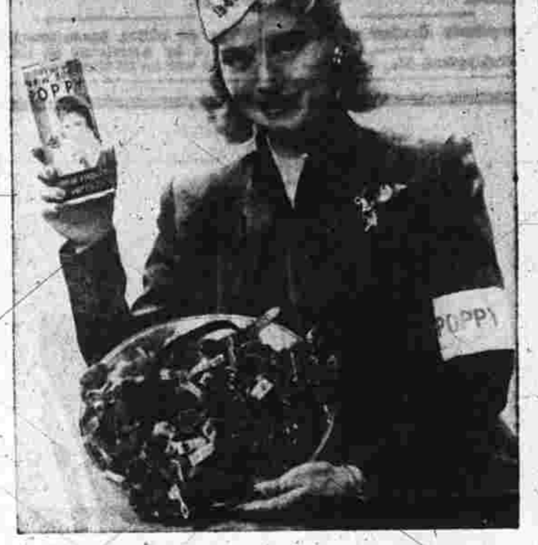
Irene Manning, beautiful blonde star of screen and radio, wearing the cap and accessories which identify her as the 1942 National Buddy Poppy Girl of the Veterans of Foreign Wars of the United States.